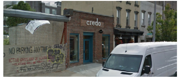
The retail transaction with the highest price per SF was 99 North 6th Street in the North Brooklyn region, which sold for approximately $5,480 per SF.

This study shows Brooklyn commercial retail building transactions for 2017, broken down into region and neighborhood. Considered data points include: total dollar volume, total number of transactions, average sale price, total square footage sold and average price per SF.