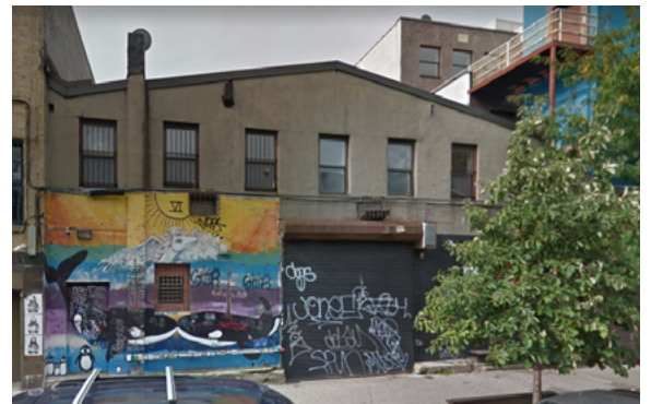
The largest retail transaction in 2017 was 60 North 6th Street - a 10,000 SF building in the North Brooklyn region. The property sold for $19.8M.