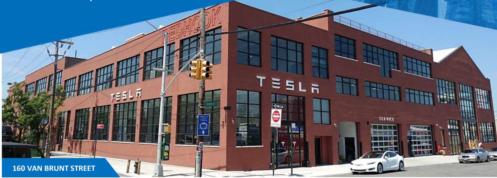
160 VAN BRUNT STREET